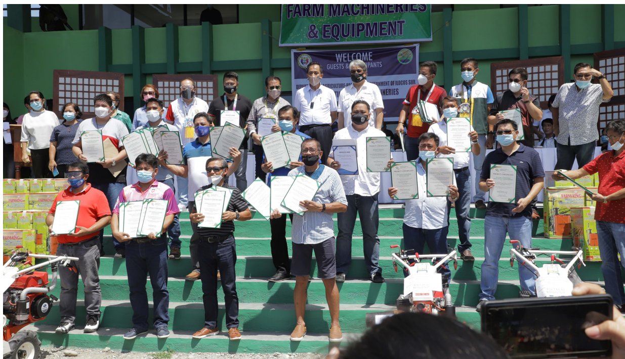
Farmer associations receive their certificates of turn-over as recipients of the various farm machineries worth PhP 55.85M during the visit of Secretary Dar in the province of Ilocos Sur in September.