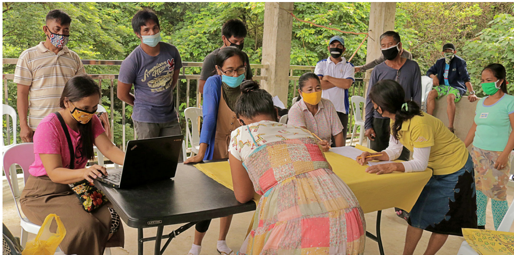
Residents of Brgy. Diaz, Umingan actively participate in the Participatory Rural Appraisal approach conducted in their area for the identification of interventions fitting to their needs under the 300-ha. farm consolidation project.

The Department of Agriculture Regional Field Office 1 will be establishing one of its pilot areas for the Farm and Fisheries Clustering and Consolidation Program (F2C2) in a 300-hectare consolidated farms in Brgy. Diaz, Umingan, Pangasinan.