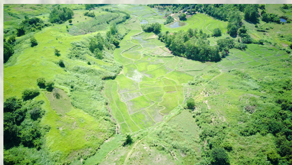
An aerial view of some of the target areas for the 300-hectare consolidated farm

With the average size of farms in the country that has continually shrank from almost three hectares per family in the 1980s to 0.9 hectare as of 2012 (PSA), F2C2 is seen to drastically change the country's current agriculture situation as it has led other countries to an increased agricultural production levels, higher incomes and better access to resources, technologies and markets. ###