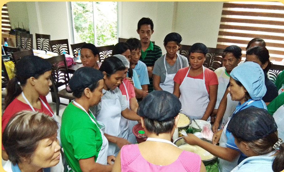
Attentive to details, women and youth participants listen and observe on the step by step process of preparing a cassava delicacy.

Developing cassava as a fruitful business opportunity, selected women and youth from farmers' organizations in the region completed the investment seminar and entrepreneurial skill training on cassava processing for three days.