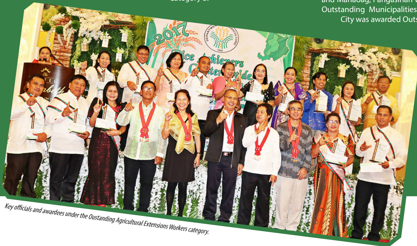
Key officials and awardees under the Outstanding Agricultural Extensions Workers category.

The municipalities of San Mateo, Isabela and Manaoag, Pangasinan were awarded Outstanding Municipalities while Tabuk City was awarded Outstanding City.