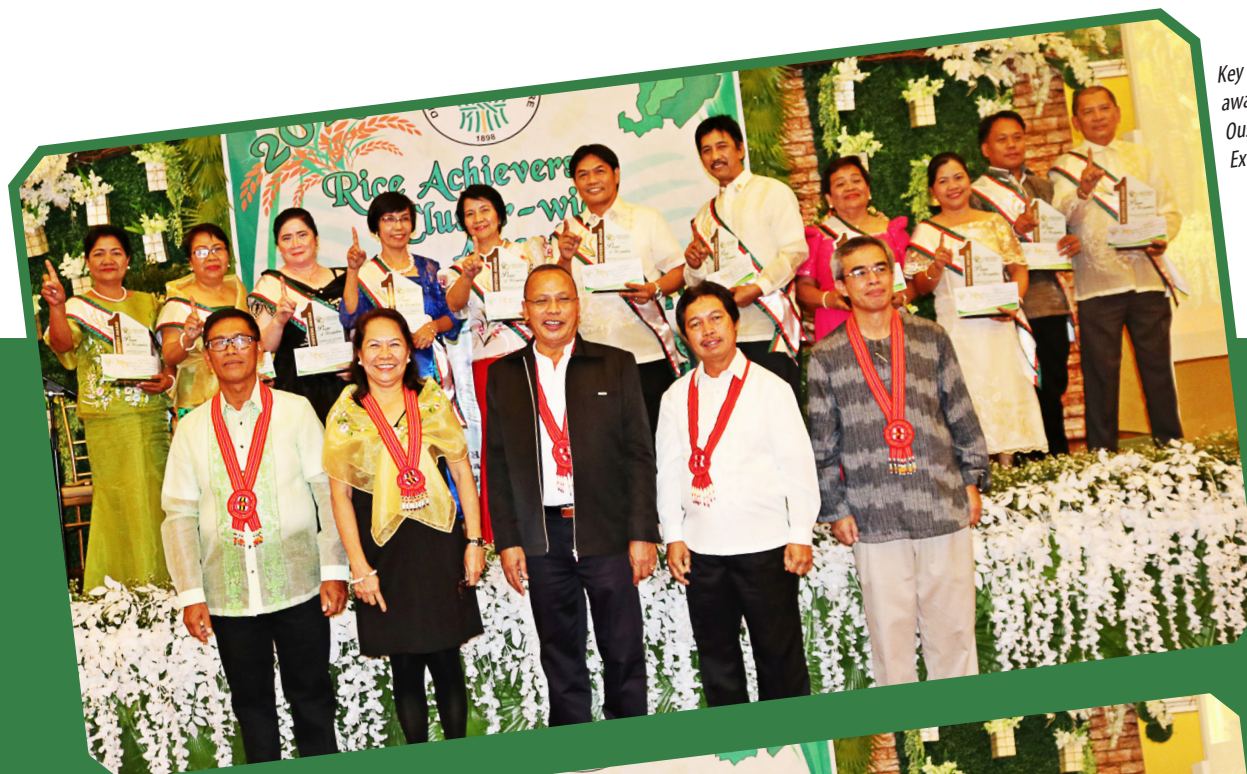
Key officials and the awardees under the Outstanding Agricultural Extensions Workers category.

Based on the report of PSA for 2017, five provinces in the North Luzon Cluster - Nueva Ecija, Isabela, Pangasinan, Cagayan, and Tarlac are among the top ten rice-producing provinces in the country. These provinces contributed 5.18 million metric tons (or 31%) from the total 19.28 metric tons in the rice production of the country last year. //