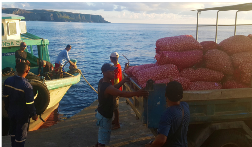
From Batan, sacks of garlic are travelled to Itbayat for storing.