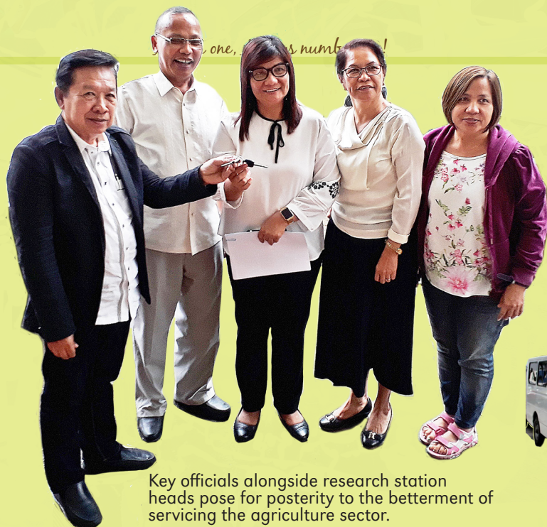
Key officials alongside research station heads pose for posterity to the betterment of servicing the agriculture sector.