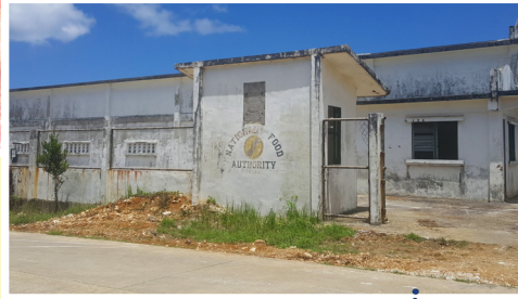
Formerly used by National Food Authority, this facility was maximized as a warehouse for garlic.//