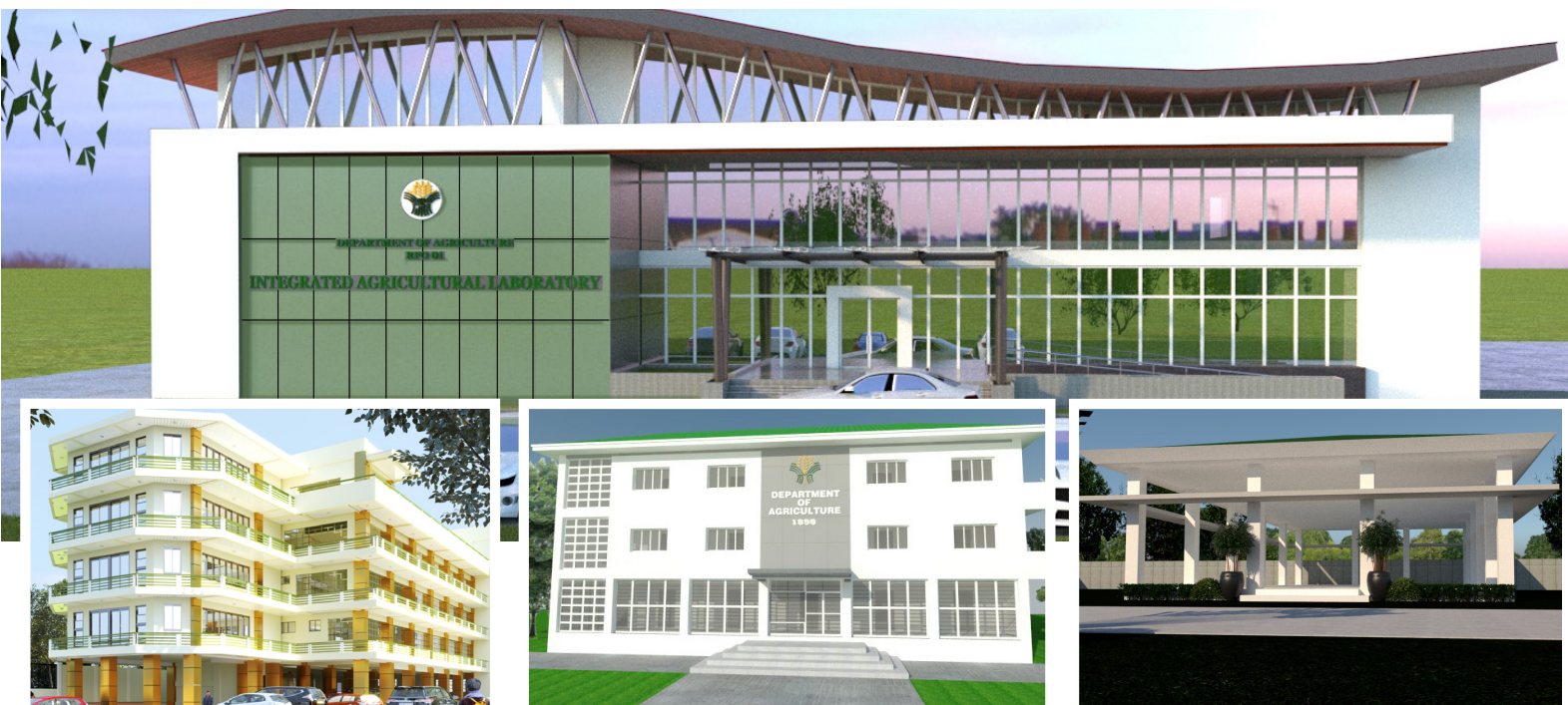
(Top photo) The proposed design of Ilocos Region Integrated Agricultural Laboratories, PREC.