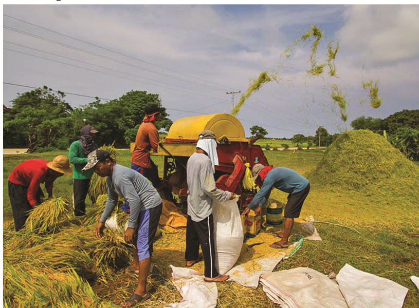
Region I farmers remain steadfast with the agri-sector's positive growth.